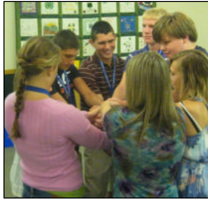
YouthLEADS group participating in teambuilding activities during the first YouthLEADS session

S: Service-Graduate and focus on the future with an emphasis on sustainable community service.