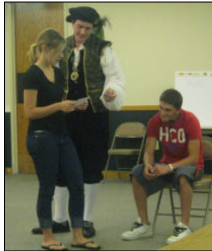
ISU Performing Arts students teach YouthLEADS students some Shakespeare during the Awareness Session