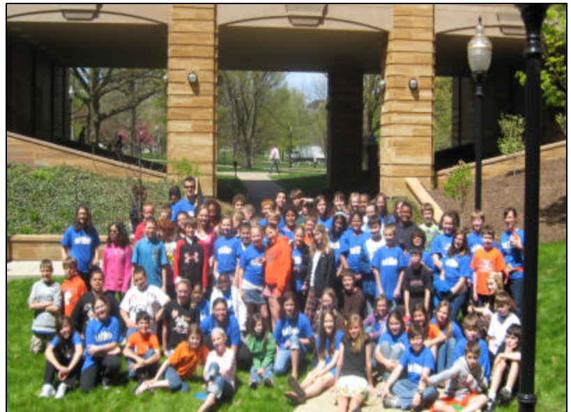
6th Graders from Chiddix enjoy their final session with Katie's School of Insurance with a field trip to ISU's State Farm Business building

Among some of the culminating projects and final sessions that various 6th grade classrooms engaged in this year were a book drive for New Orleans Public Library, a fieldtrip to Schnucks, putting together a 'job fair', a tour and behind-the-scenes view of operations at the Chateau Hotel,