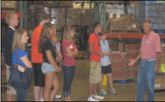
The group volunteering at the Midwest Food Bank during the Engagement Session

In June, McLean County Junior and Senior high school students had the opportunity to participate in a youth leadership program called YouthLEADS. The YouthLEADS concept was formed by a sub-group of the 2008 Leadership McLean County class of the Chamber of Commerce adult leadership program. They were interested in forming a program for youth involving leadership skills and traits. The students undergo a short application process and are hand-picked to participate in this program.